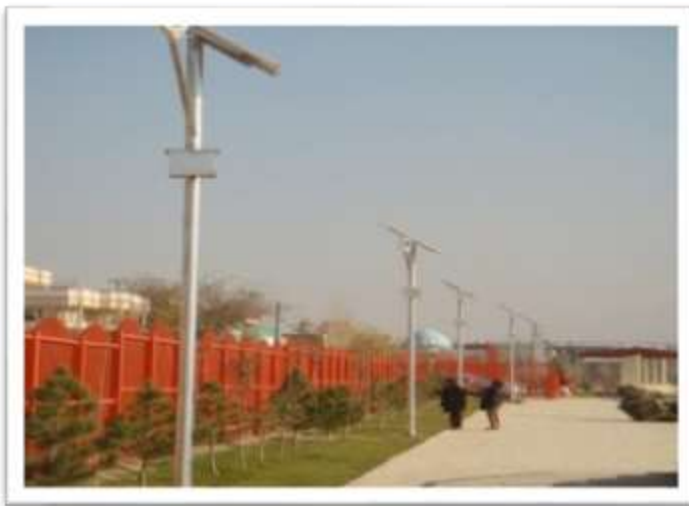
Solar panel installed in the KCI constructed portion of the park, District no 12, Kabul