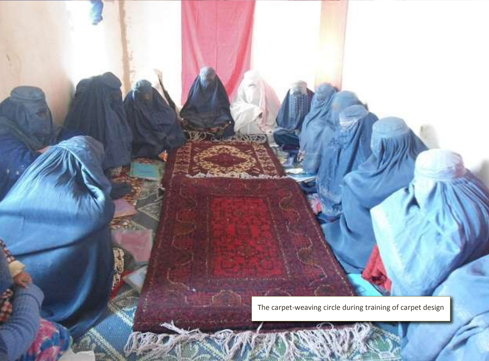
The carpet-weaving circle during training of carpet design