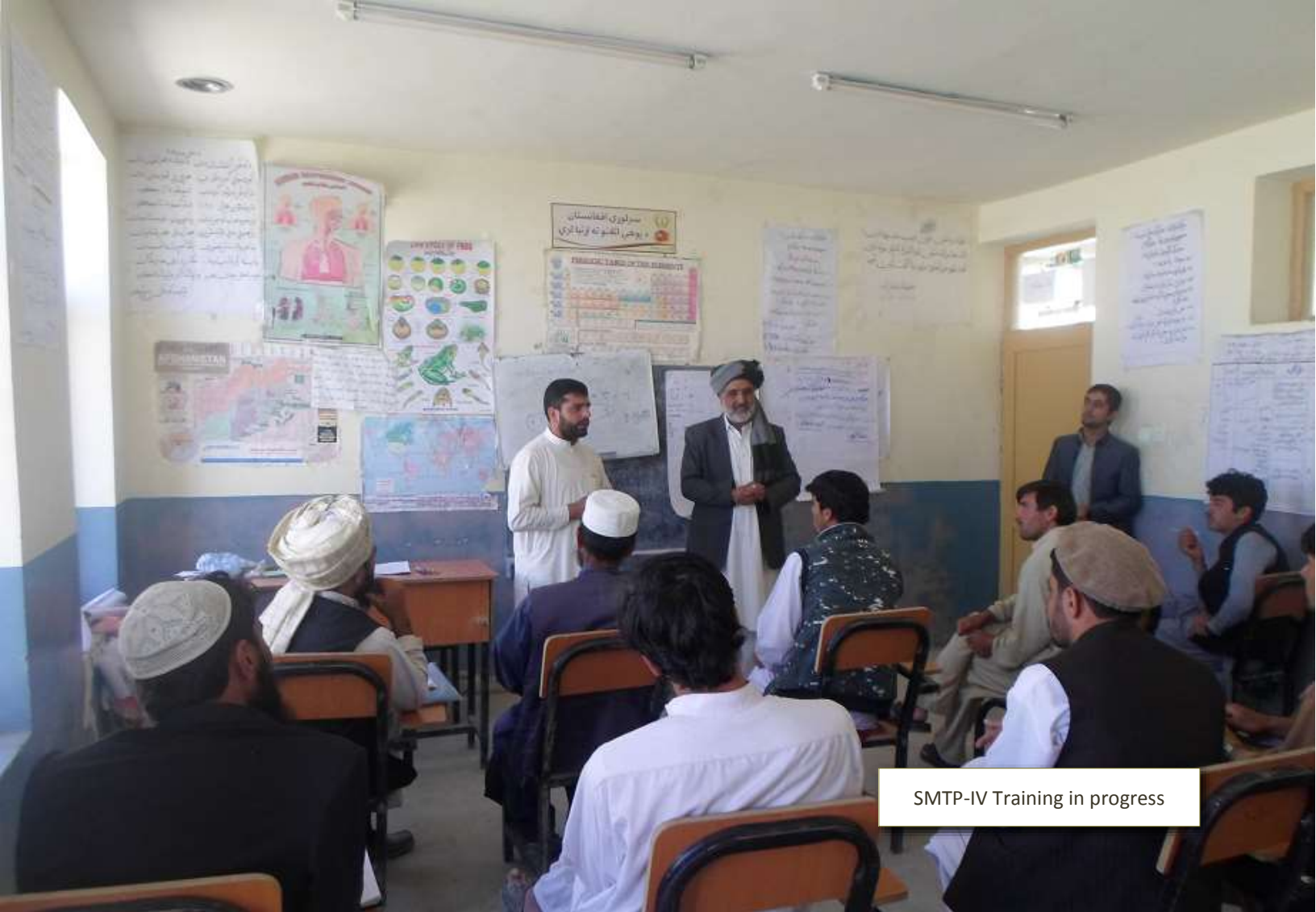
SMTP-IV Training in progress