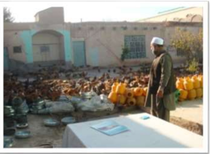
Poultry kits (Pullets, Drinkers, Feeders and Feed) ready for distribution, Tirinkot, Uruzgan province