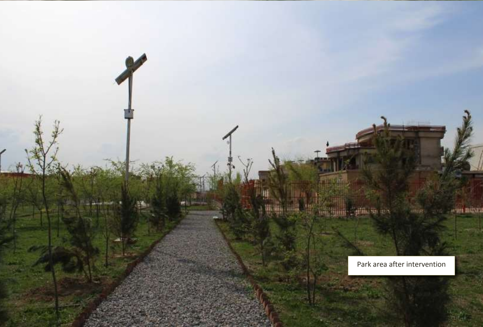
Park area after intervention