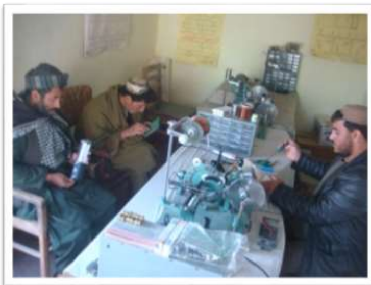
Solar training course