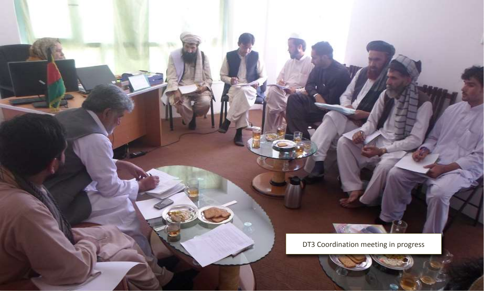
DT3 Coordination meeting in progress