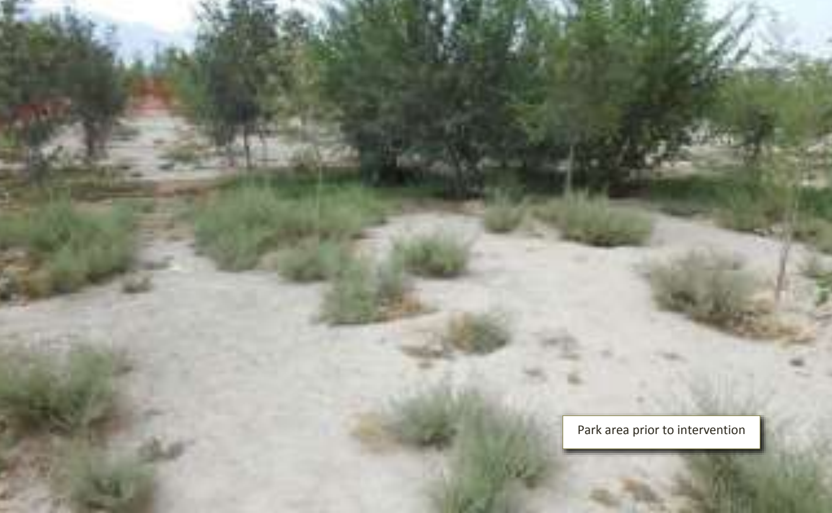
Park area prior to intervention