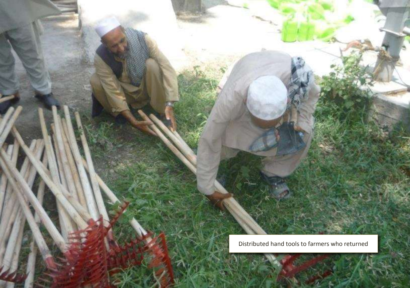
Distributed hand tools to farmers who returned