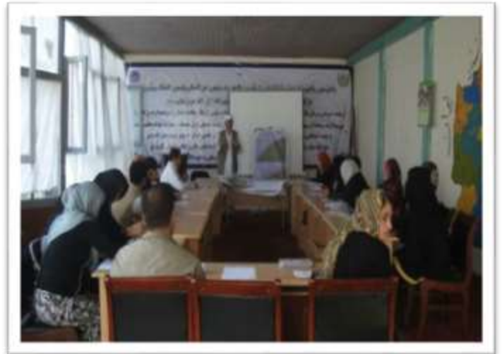
Provincial Consultation training conducted for the department of women affairs in Taloqan, Takhar province.