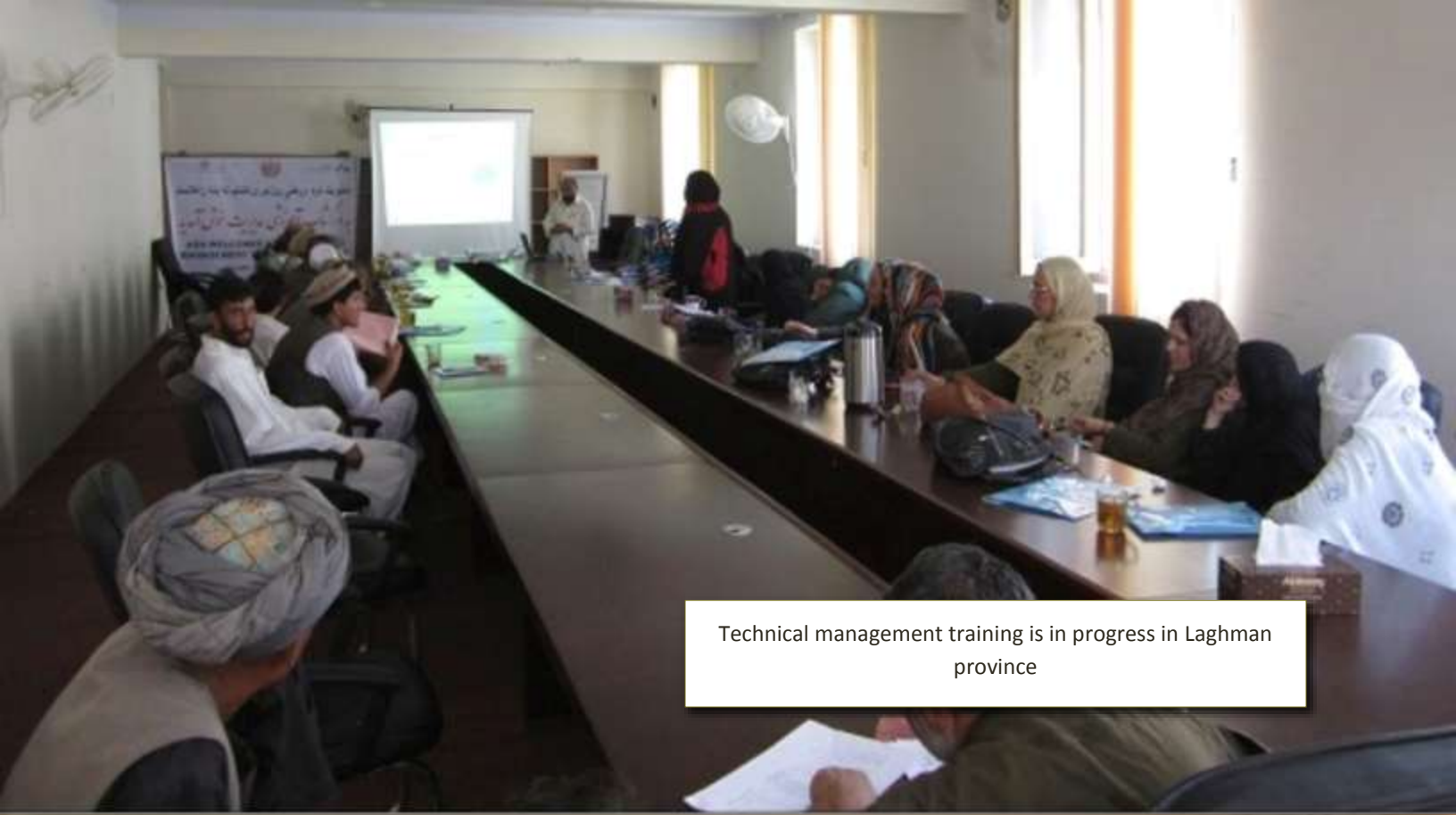
Technical management training is in progress in Laghman province