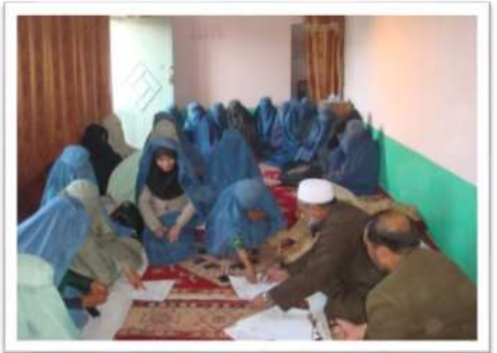
Loan distribution being documented by the Distribution Committee