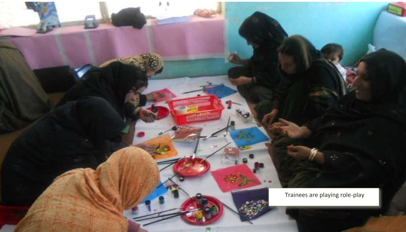
Trainees are playing role-play