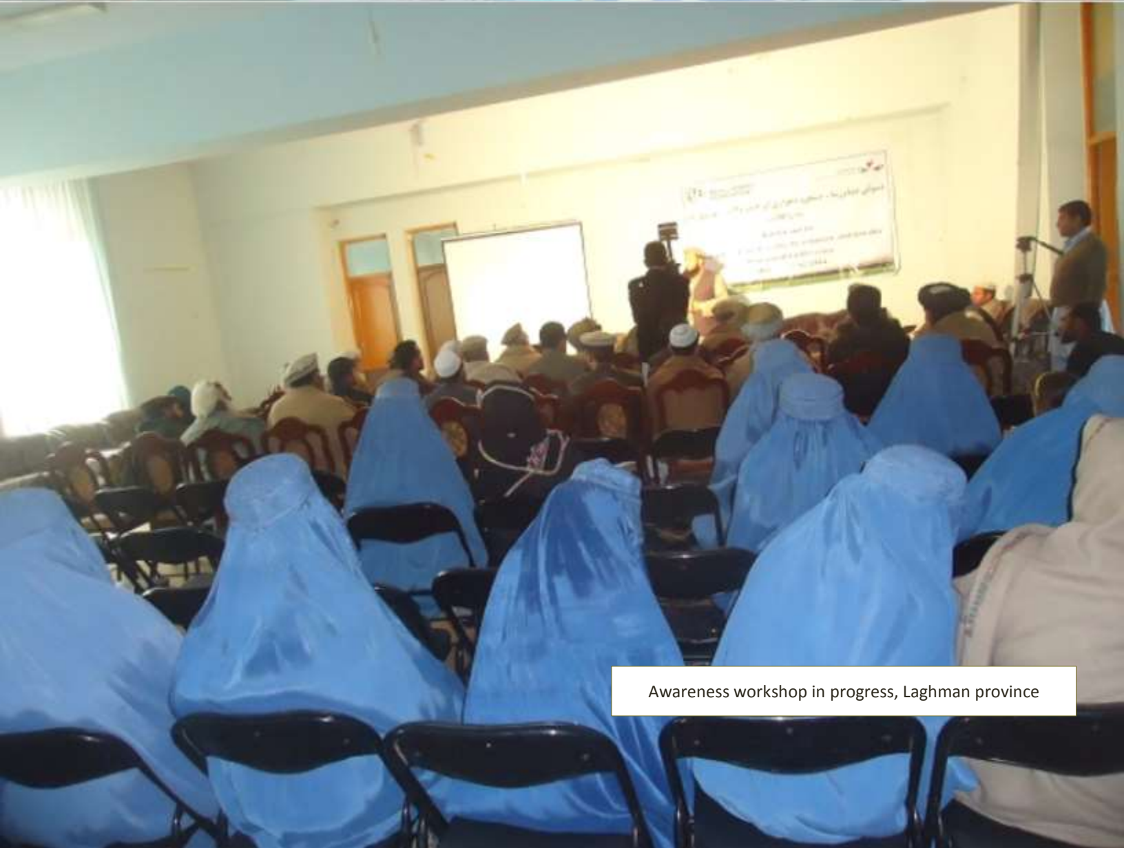
Awareness workshop in progress, Laghman province