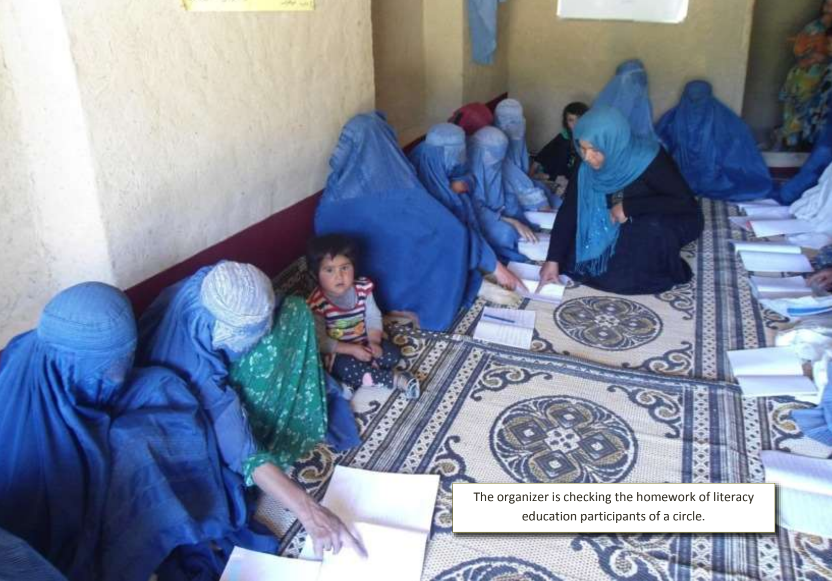
The organizer is checking the homework of literacy education participants of a circle.