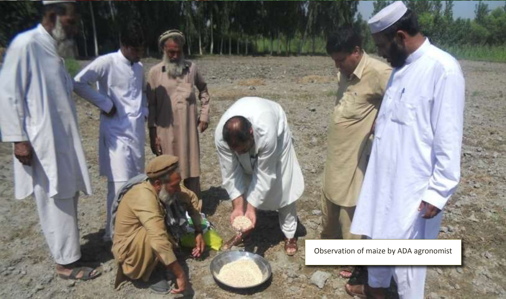
Observation of maize by ADA agronomist