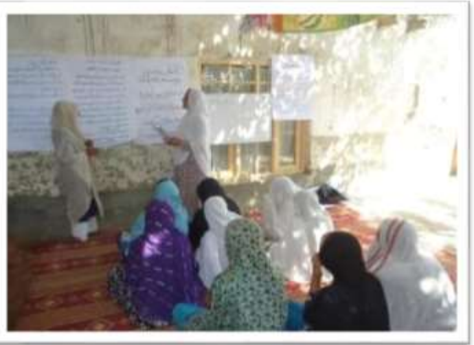
Animal feed preparation training in Alishang district, Laghman province