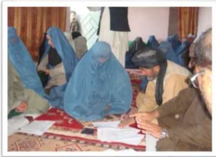
District representative distributing loan to women