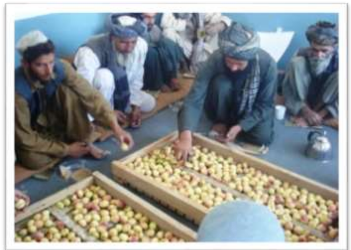
Training of Apricot drying by sulfur, Tirinkot, Uruzgan province