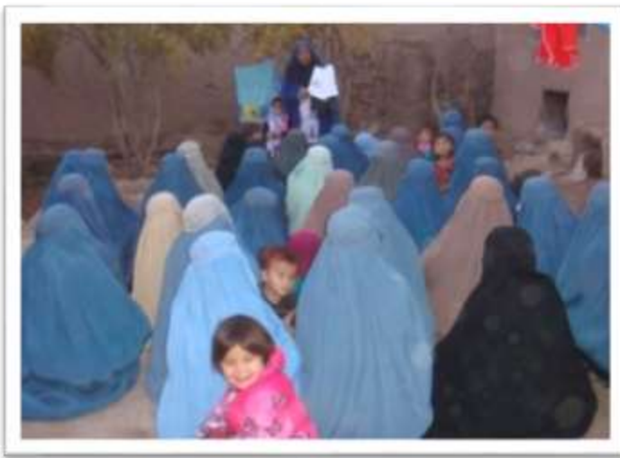
Training session on poultry keeping and hygiene in progress, Tirinkot, Uruzgan province