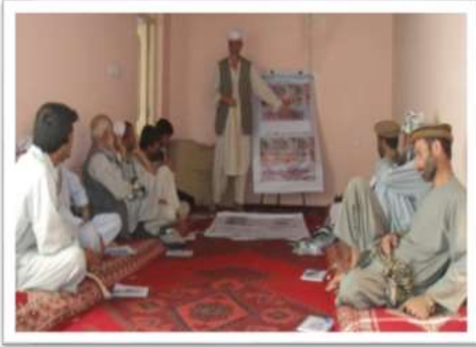
Refresher training session conducted for Darya peace committee in Taloqan, Takhar province