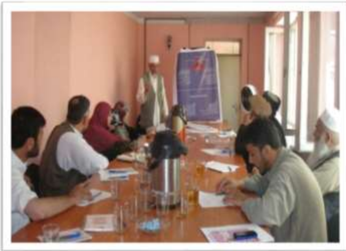
Training on conflict resolution and peace building conducted for religious leader/community elders and influential people in Taloqan, Takhar province.