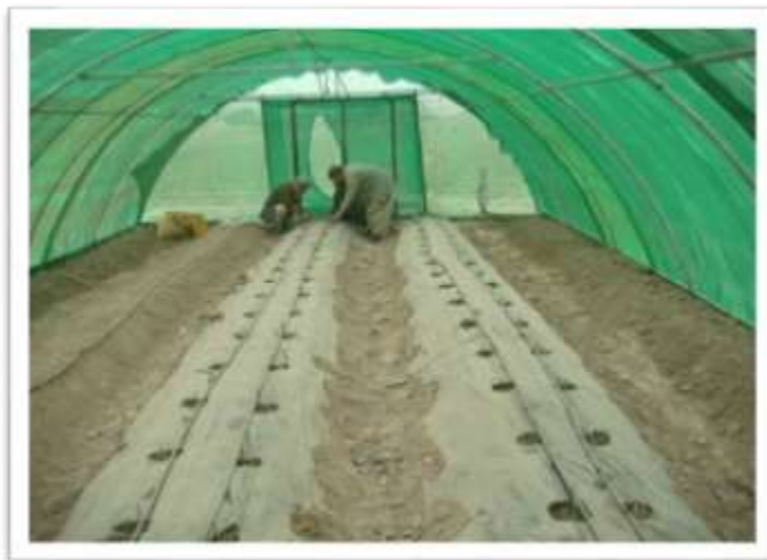
Second step, drip irrigation and layout of land, Tirinkot, Uruzgan province