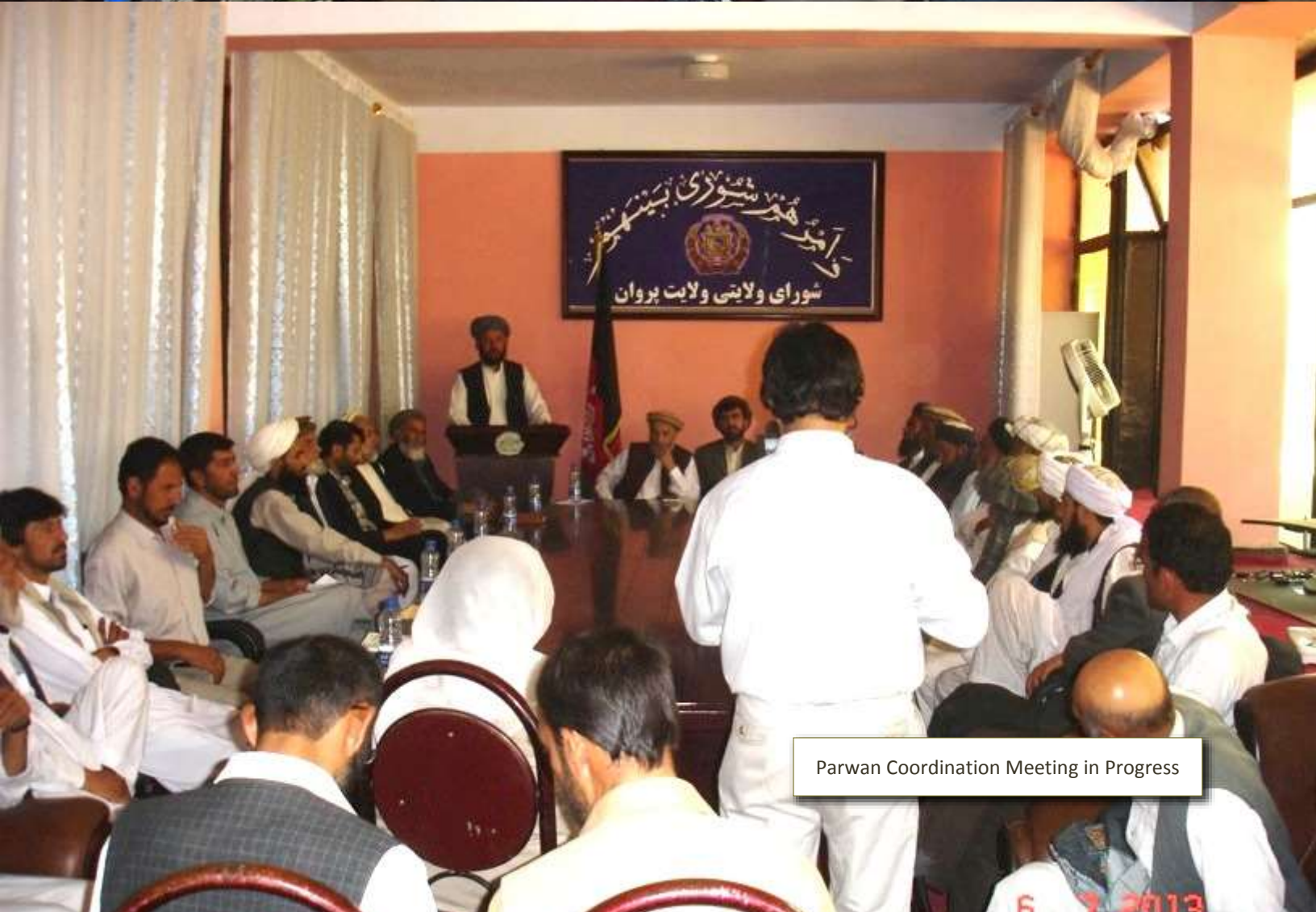
Parwan Coordination Meeting in Progress