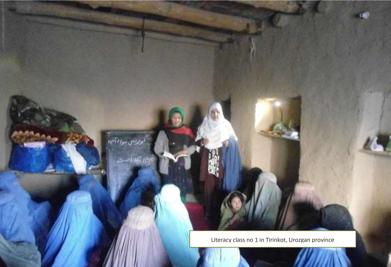
Literacy class no 1 in Tirinkot, Urozgan province