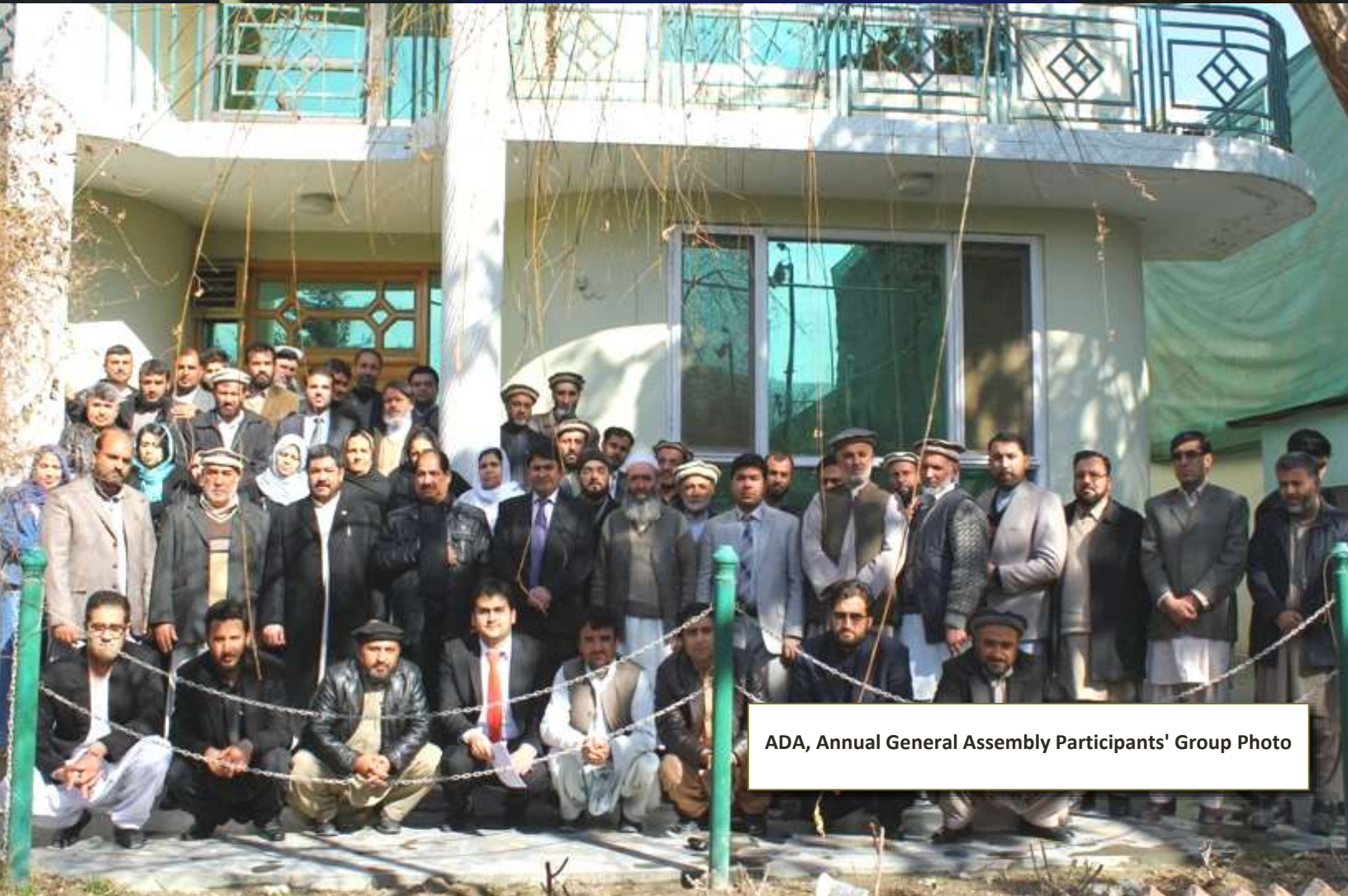
ADA, Annual General Assembly Participants' Group Photo