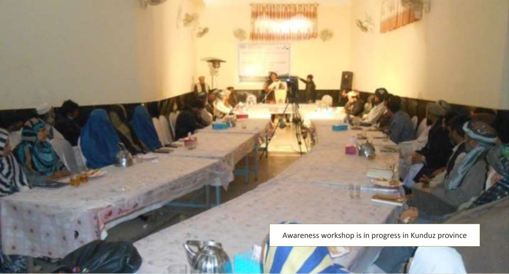
Awareness workshop is in progress in Kunduz province