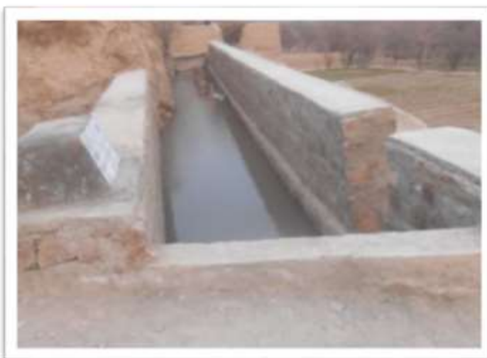
Irrigation structure of Ghulaman Canal, Tirinkot, Uruzgan province