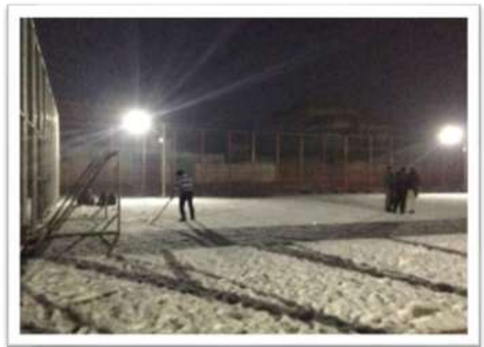
The solar lightening provided opportunity for youth to play games