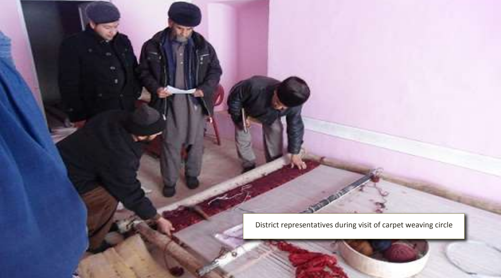
District representatives during visit of carpet weaving circle