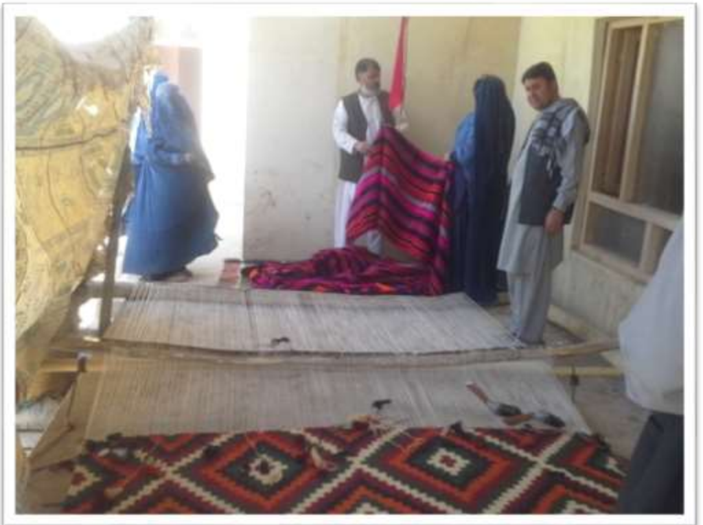
ADA Managing Director is visiting a galem (a variety of Afghan carpets) class in Taluqan, Takhar province

“Afghan women are empowered and participate on all levels in their communities in Takhar province”.