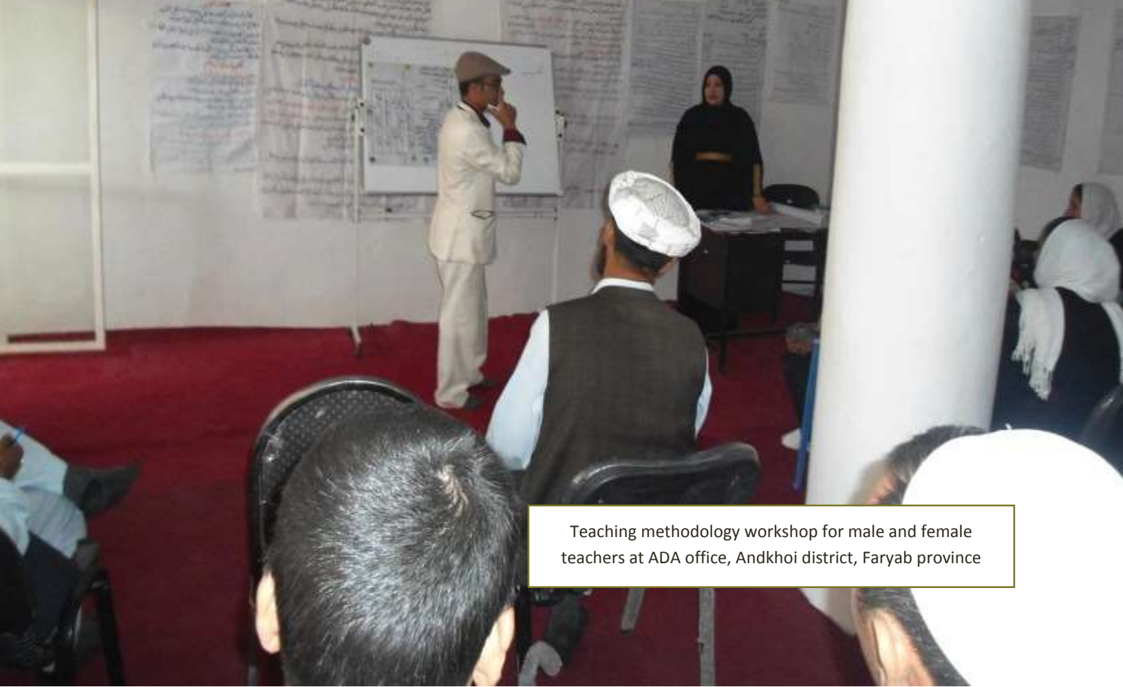
Teaching methodology workshop for male and female teachers at ADA office, Andkhoi district, Faryab province