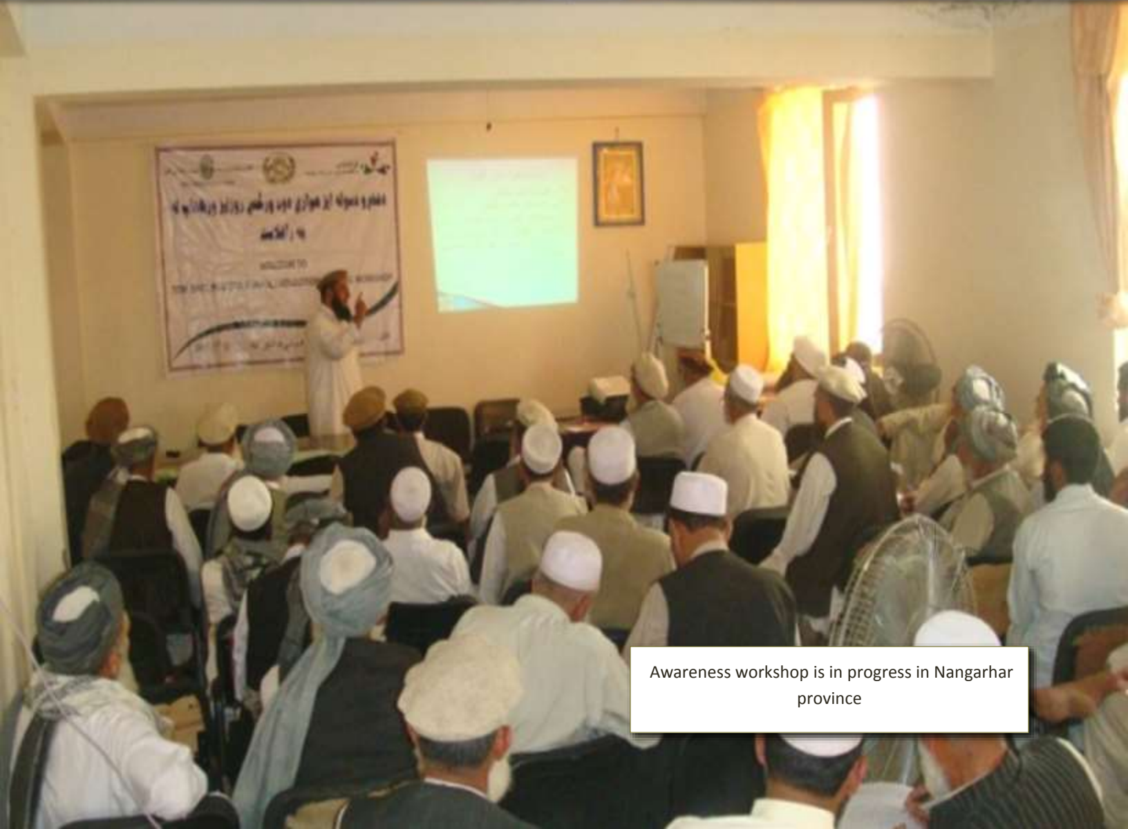
Awareness workshop is in progress in Nangarhar province