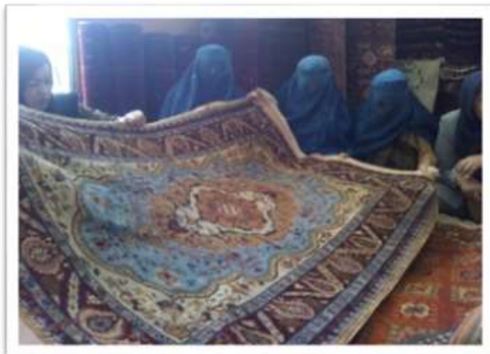
Cooperative members are taking interest in new carpet designs during visit to Kabul province