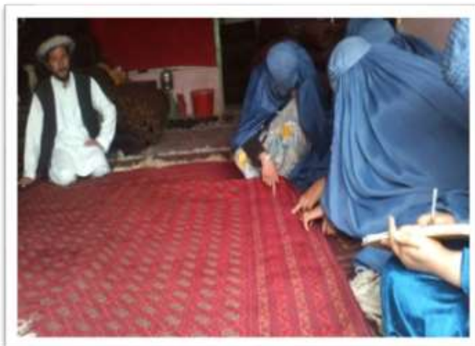
Cooperative members are taking interest in new carpet designs during visit to Mazar, Balkh province