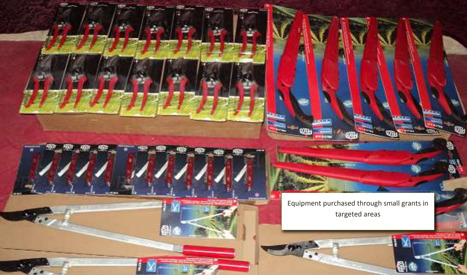
Equipment purchased through small grants in targeted areas