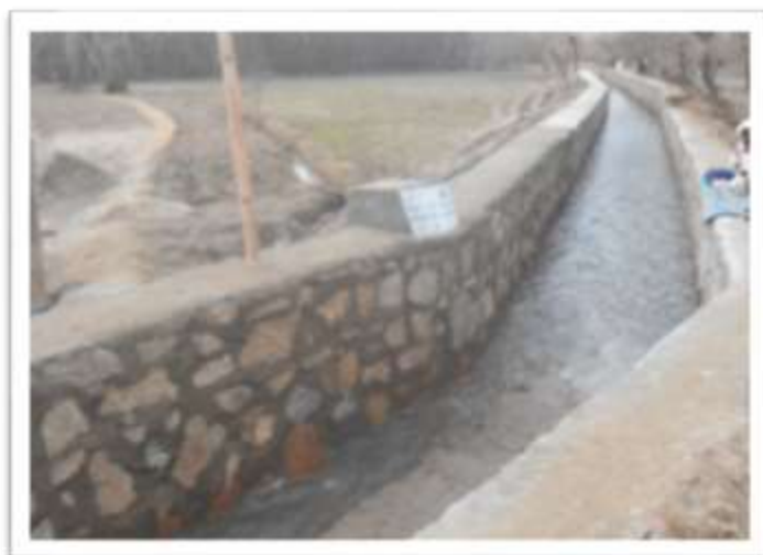
Irrigation structure of Charamgar Canal, Tirinkot, Uruzgan province