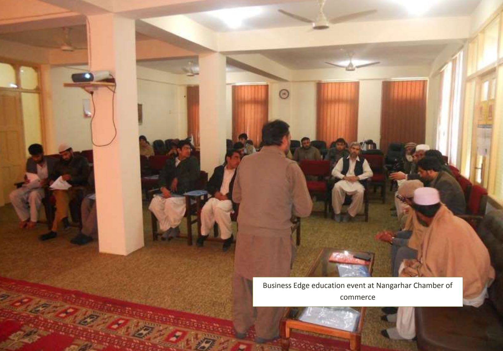
Business Edge education event at Nangarhar Chamber of commerce