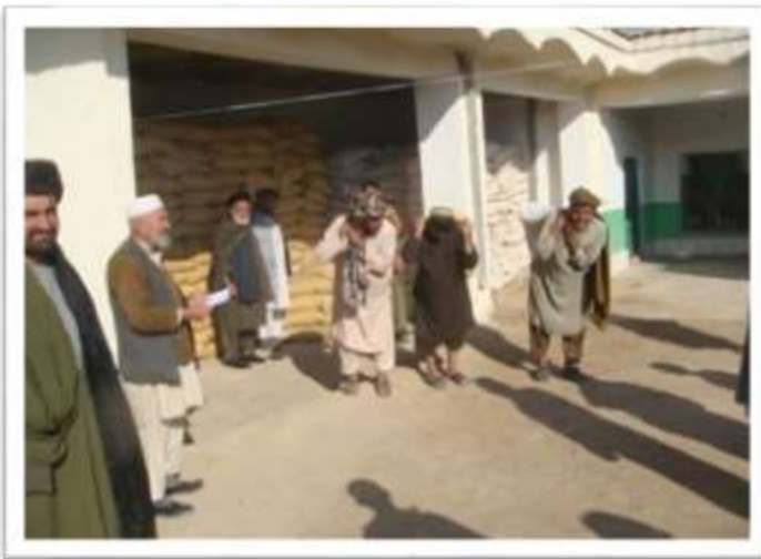
Distribution of agriculture inputs in progress in Tirinkot, Uruzgan province