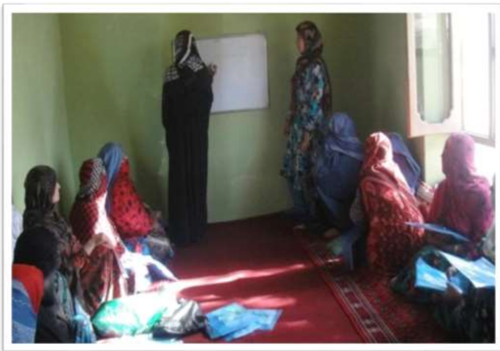
Functional literacy class in Sarai Sang village in Taluqan, Takhar province

Under this project, 150 eligible women have been identified for receiving micro credit and functional literacy training. The beneficiaries have been organized in 10 classes (eight classes in Taluqan city and two in Bangi district) with background of carpet weaving skills, gelem (a variety of carpet) and embroidery. Each class represents one Self Help Group (SHG) and each beneficiary has been provided with $200 (two hundred USD) as loan. The loan amount will be used for purchasing raw materials that will support women in their business.