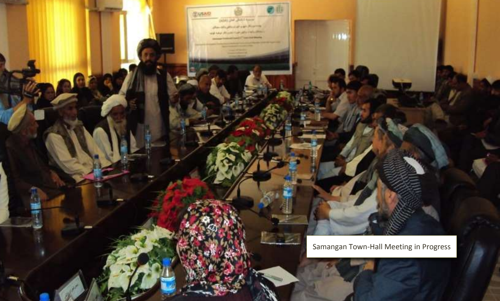
Samangan Town-Hall Meeting in Progress