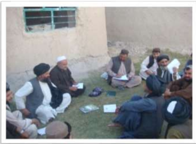
Checking documents of eligible farmers before distribution of agriculture Inputs, Tirinkot, Uruzgan province