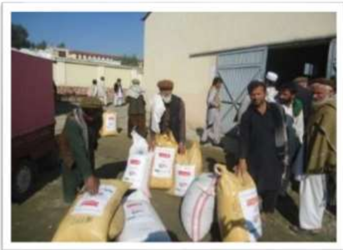
Agriculture inputs distribution process in Laghman province