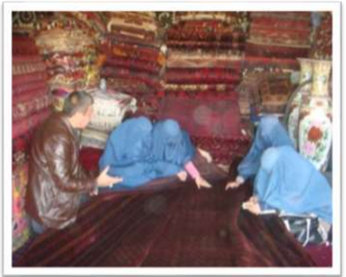
The cooperative members are taking interest in the Khwaja Roshna carpet during the exposure visit to Mazar, Balkh province

During this phase (August 2013 - December 2013) 169 carpets were sold through the community owned shop (outlet) in Faryab and the income was distributed among the carpet-producing women.