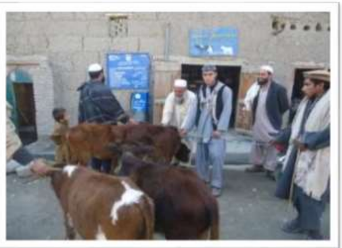
Treatment of animals in Alishang district Veterinary Clinic, Laghman province