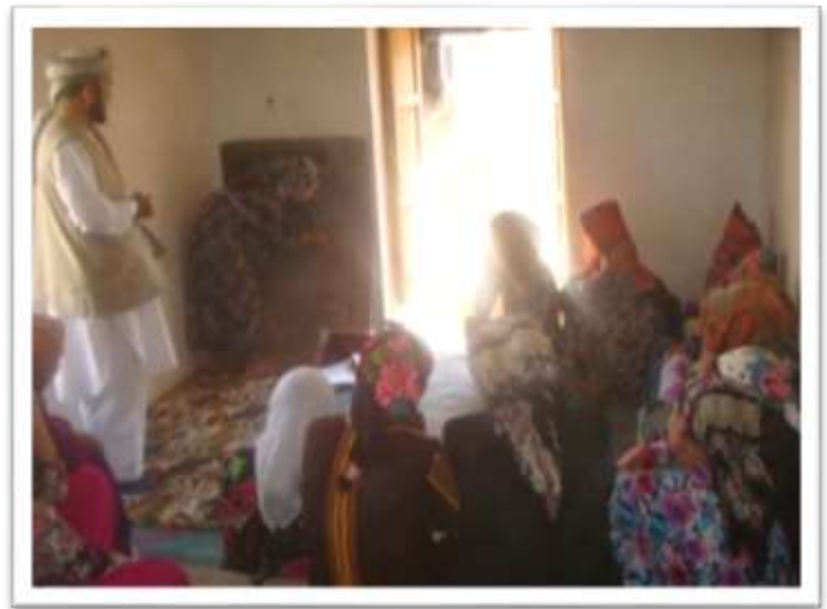
Literacy class in Qaramqul district of Faryab province

Through the implementation of this project we look ahead that in the long run the project will result in empowering rights holders and their increased participation will enable them to challenge existing inequalities and reduce marginalization.