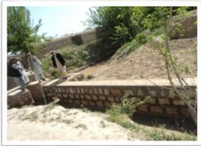
A small mitigation structure of protection wall and water divider is constructed in Dagh-e-Arq village of Chardara district, Kunduz province