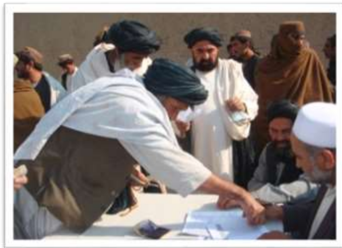
Checking of coupon for distribution agriculture inputs in progress, Tarinkot, Uruzgan province