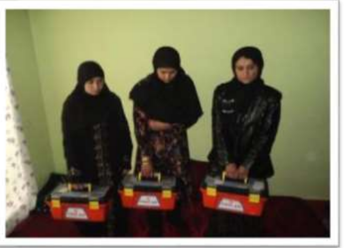
The photo shows the first aid kit distribution to community facilitators, Chardara district, Kunduz province