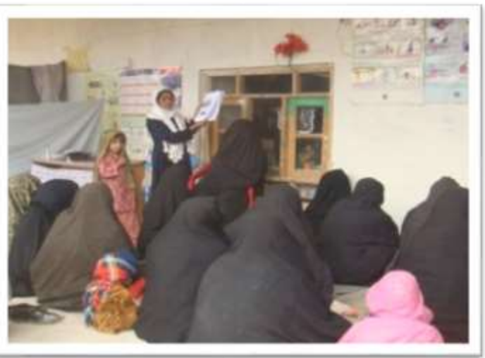
Training session on poultry keeping and hygiene in progress, Dehrawod district, Uruzgan province