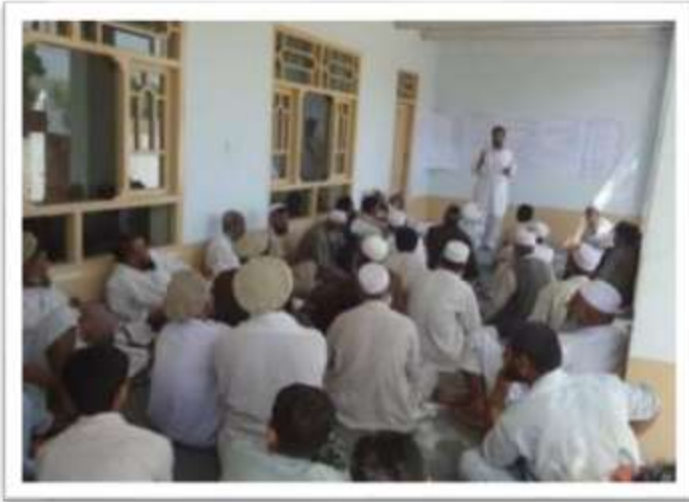
Vegetable processing training in Qarghaiee district, Laghman province